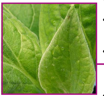
Pubescent leaves feel like a dogs tongue, hence the name.