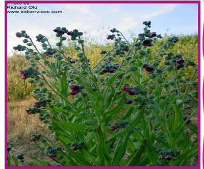
Houndstongue is a poor competitor with native perennials.