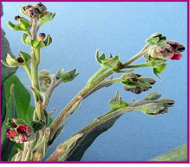
The hairs on the stems and leaves give the plant a silvery cast.