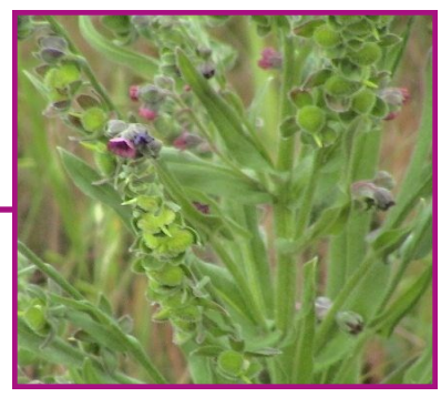
Flowers are reddish-purple with five petals, arranged in panicles.