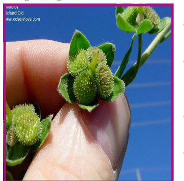
The fruit is four prickly nutlets, which look and cling like Velcro to all that come into contact.

some reason are relatively tolerant of the alkaloids. The alkaloids in Houndstongue has a cumulative effect on the liver and pretty much will