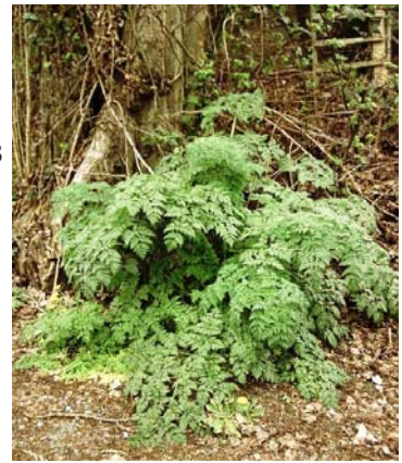
In late winter, look for mounds of bright green, lacy leaves. The largest clumps are second-year plants building up energy to flower and seed later in the spring.

Poison hemlock is not yet widespread in Mason County, and the Mason County Noxious Weed Control Program is trying to control its spread, especially in areas that are accessible to people, pets and livestock. All parts of the plant are poisonous when eaten and even dead canes remain toxic for up to three years. Toxins can also be absorbed through the skin and respiratory system so always wear protective clothing (gloves, glasses, mask) when handling this plant. If you suspect poisoning, call for help immediately. In both humans and animals, quick medical treatment can reverse the effects of hemlock poisoning.