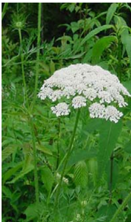
Don't be fooled: Wild carrot (sometimes called Queen Anne's Lace) is often confused with poison hemlock.

well as broadleaf plants. Apply the herbicide to the entire leaf and stem surface and do not cut down the treated plants until they have died. This may take two weeks or more. Seeds germinate throughout the season, so repeat treatment is necessary to eliminate all plants. Chemical control options may differ for private, commercial and government agency users. For questions about herbicide use, contact the Mason County Noxious Weed Control Program.