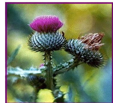
Flowers are globe shaped, violet to purple, 1-2 inches wide.