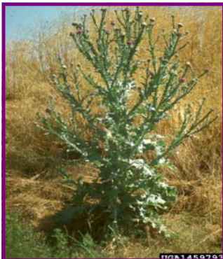
Mature plants can reach a height of 8-12 feet tall.

Scotch thistle is usually a biennial, although it can behave as a winter or summer annual or a short-lived perennial under certain