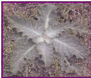
Rosettes can be 6 feet wide and form dense patches.