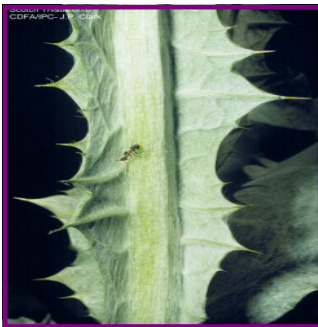
The stems have spiny wings, which makes this plant an increased hazard to humans and animals.