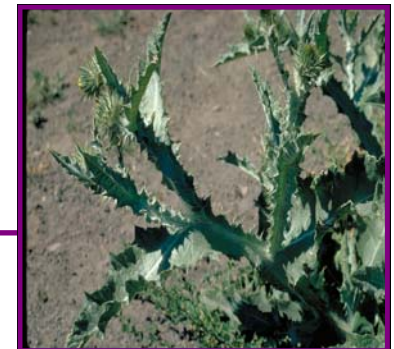
Stems are broad with spiny wings.