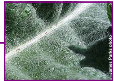
Upper and lower leaf surfaces are covered with a thick mat of cotton-like or woolly hairs, which give the foliage a gray-green appearance.