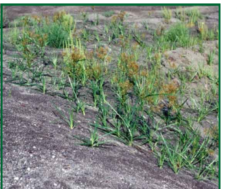
Yellow nutsedge plants are easy to spot when in bloom.