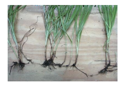
Yellow nutsedge spreads through tubers and rhizomes.