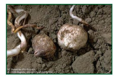
Yellow nutsedge tubers are small and have a nutty taste.