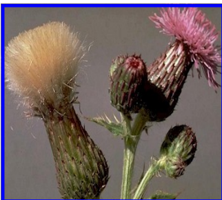
The pinkish purple blossom contains several hundred seeds, in a head similar to that of a Dandelion.