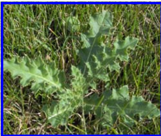
Rosettes form in late April through May.