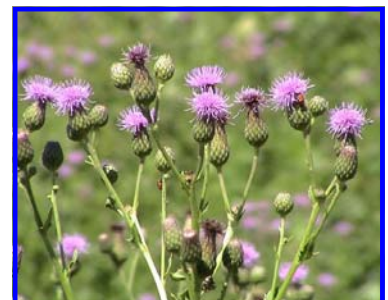
One plant can colonize an area 3 to 6 feet in diameter in one or two years.