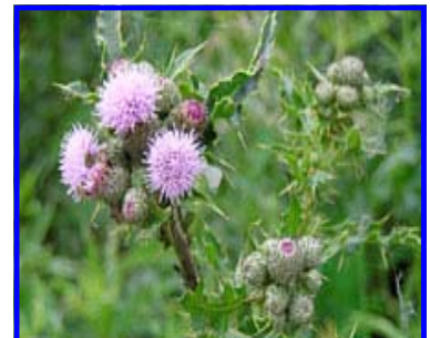
The flowers are pinkish purple and arranged in clusters.