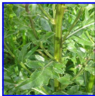
Stems are grooved and smooth to slightly hairy.