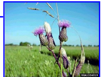
Some good news: If the plant is male, the seed in the fluff you see blowing in the wind is sterile.