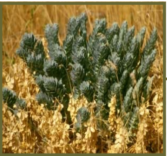
Myrtle Spurge is capable of projecting seeds 15 feet.