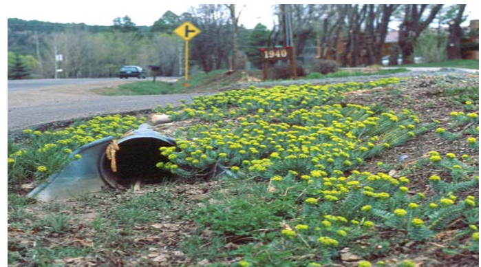
Myrtle spurge allowed to grow along a drainage ditch where it has the potential to spread downstream.

Photos courtesy of : Kemper Center for Home Gardening, Mo. ; Dan Sharratt, ODA.