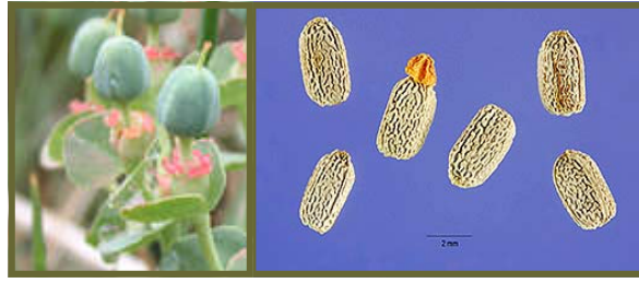
Seed pods on the Myrtle Spurge and later dried seeds.

Lincoln County Noxious Weed Control Board 405 Ross St. Davenport, WA 99122