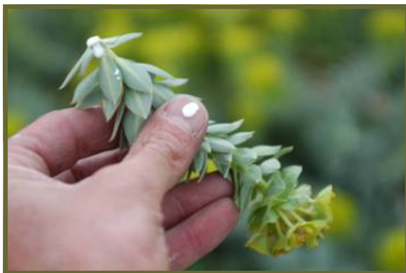
Picture shows the toxic white milky sap of the Myrtle Spurge plant.