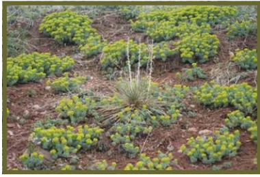
Shows how the Myrtle Spurge spreads.