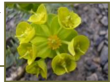
A close-up of the Myrtle Spurge heart shaped bracts.

plant can rapidly expand into sensitive ecosystems, displacing native vegetation and reducing forage for wildlife.