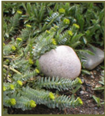
Myrtle Spurge is commonly found in rock gardens.