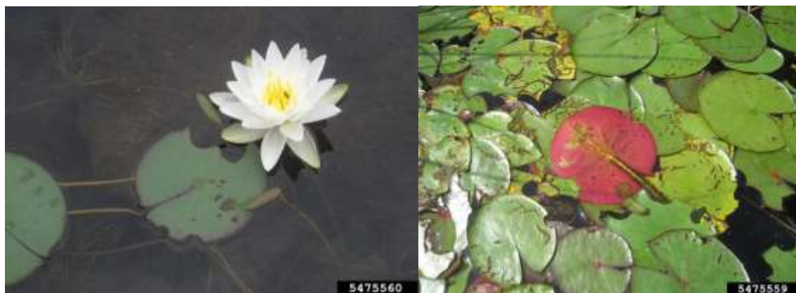
Figure 1. (Left) Blooming Nymphaea odorata with circular leaves, image by Rob Routledge, Sault College, Bugwood.org. (Right) Dense cover of N. odorata leaves with one turned over to show reddish underside and venation, image by Rob Routledge, Sault College, Bugwood.org.

Nymphaea odorata is an aquatic, perennial plant. Leaves and flowers generally float on the water's surface, growing from submerged rhizomes. Plants are absent of stolons (Wiersema 1997).