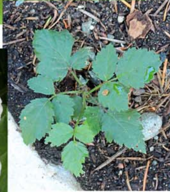
Himalayan blackberry - Rubus discolor

Controlling noxious weeds on your property is your responsibility and the law. Chapter 17.10 RCW, County Code Title 7