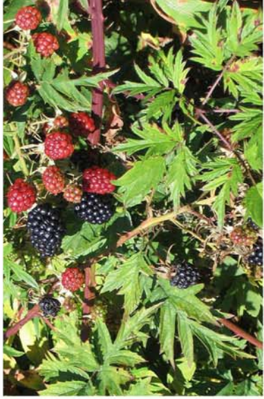
Evergreen blackberry - Rubus laciniatus